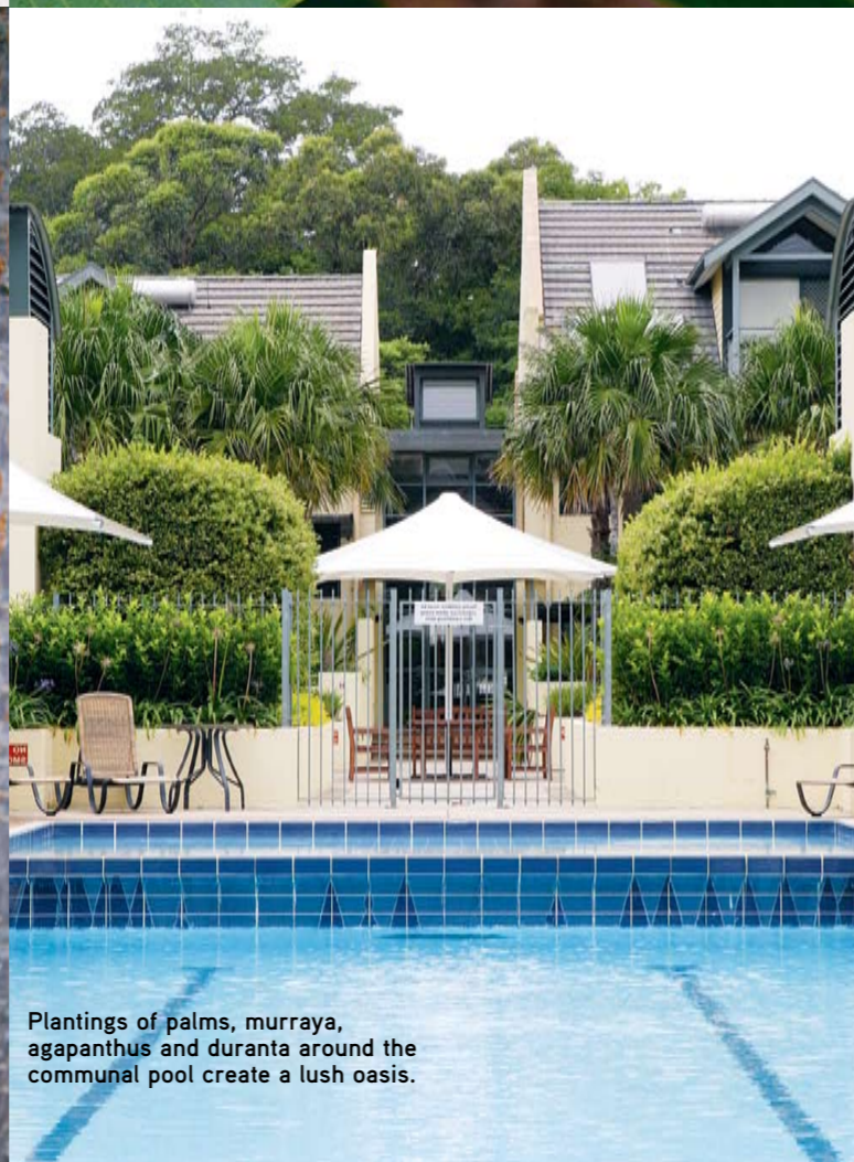
Plantings of palms, murraya, agapanthus and duranta around the communal pool create a lush oasis.

The roots of the plants also needed to be non-invasive, as all the garden beds are actually planter boxes that are built above the car park. These raised beds range from 60cm to 1.2m in depth.