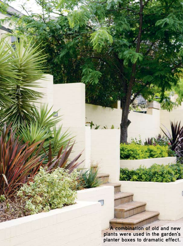
A combination of old and new plants were used in the garden's planter boxes to dramatic effect.