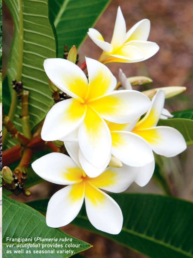
Frangipani ( Plumeria rubra var. acutifolia ) provides colour as well as seasonal variety.