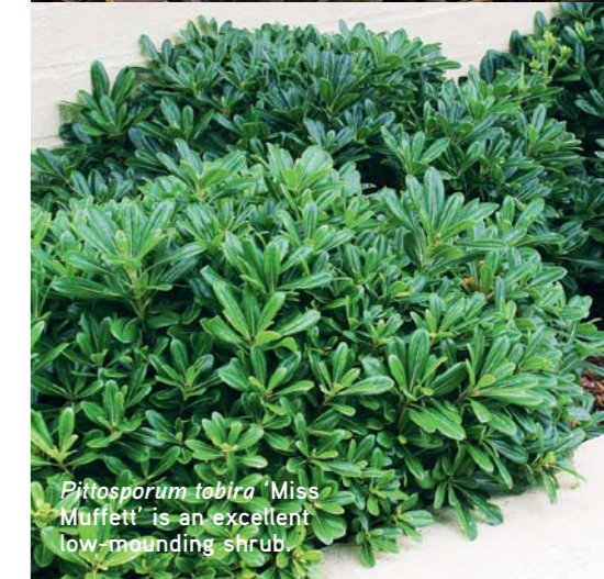
Pittosporum tobira 'Miss Muffett' is an excellent low-mounding shrub.