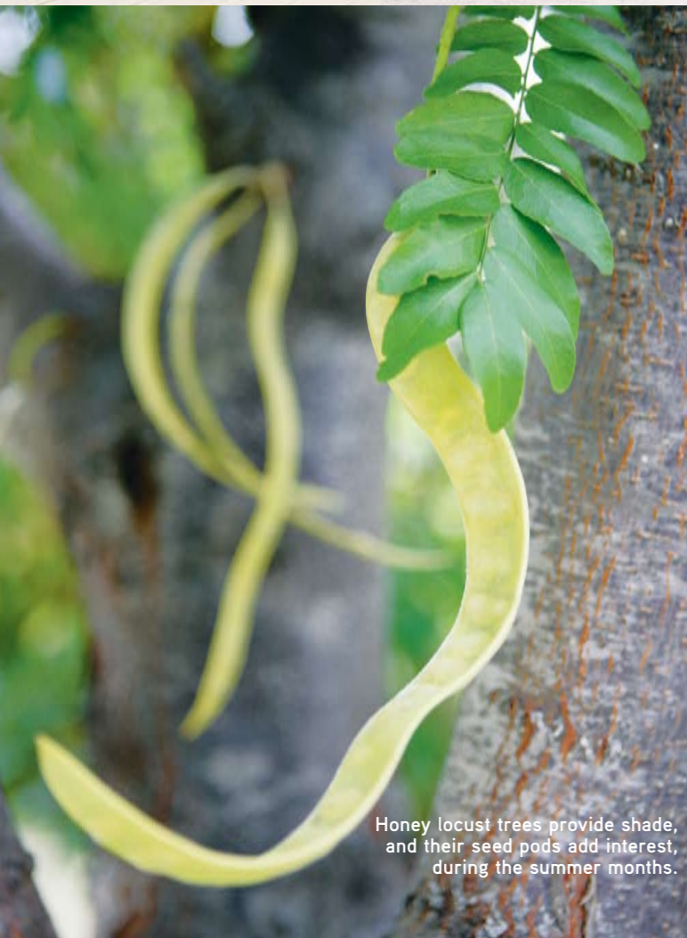
Honey locust trees provide shade, and their seed pods add interest, during the summer months.